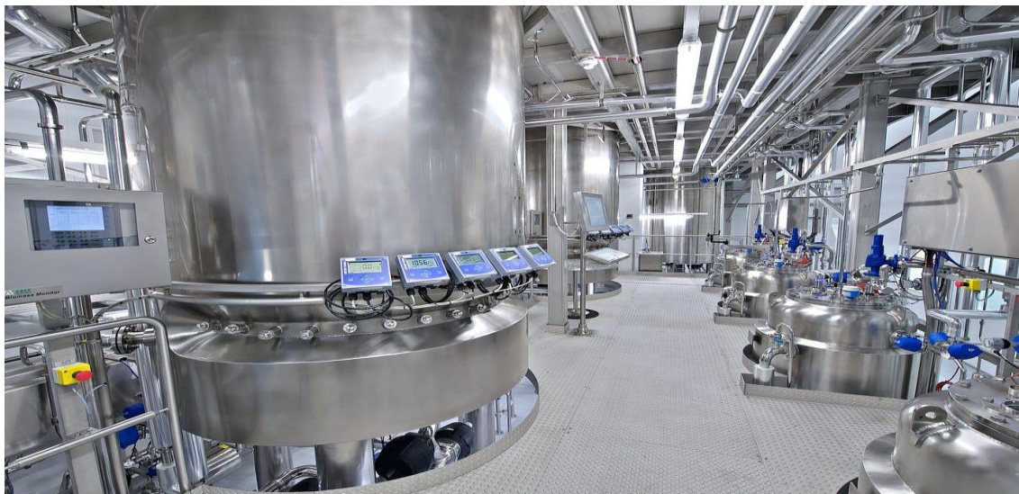
Fig No: 03 AI Quality Control

Predictive Analytics: AI algorithms predict the shelf life of dairy products based on historical data and real-time monitoring of storage conditions. This helps in optimizing inventory management and reducing waste. Optimized Storage and Distribution: AI systems can recommend optimal storage and distribution practices to maintain the freshness of dairy products, ensuring they reach consumers in the best possible condition.